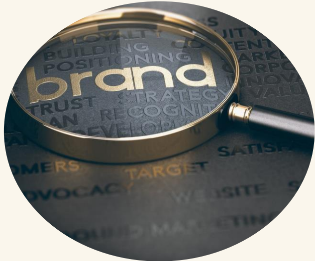
Increased Scrutiny by Stakeholders & Public Officials