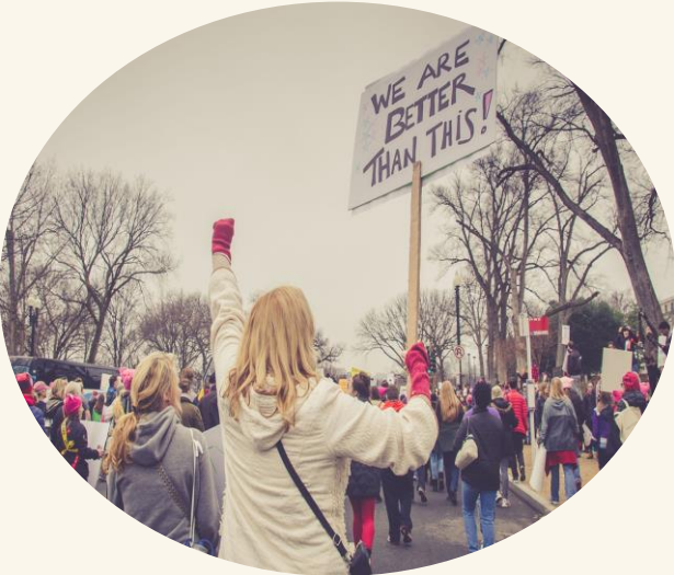
Changing Political Landscape